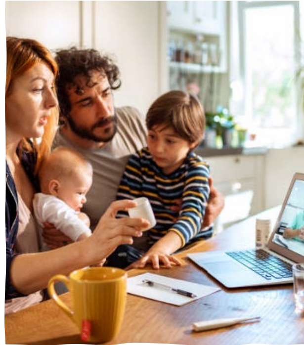
Medication & Alternative Treatments