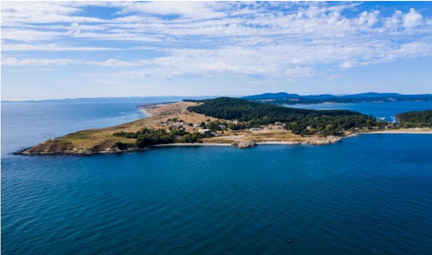
Cattle Point, San Juan Island

Consistent with the Public Hospital District definition, the service area is defined as all of San Juan Island, as well as Stuart, Henry, John’s, Spieden and Pearl islands. The remainder of the county is considered a secondary service area.