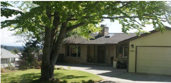
The locker room, living room and outside of the Hepp House, which also boasts six bedrooms, six bathrooms and a shared living space for caregivers.