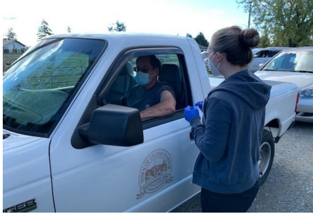
Community partners and PeaceHealth greet residents during the 2020 drive-thru flu vaccine clinic

Many families also brought children to the clinic, with some bravely getting their first COVID vaccination. Sea Mar’s multi-lingual care team conducted preventative screenings, provided immunizations, and offered the opportunity to discuss health issues with community health workers.