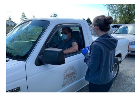
Community partners and PeaceHealth greet residents during the 2020 drive-thru flu vaccine clinic

This is especially true when patients leave a medical center or healthcare facility and return home to manage their own care on the island. Some low-income community members who lack health insurance end up traveling off-island to obtain medical care—resulting in lost wages and inconsistent care.