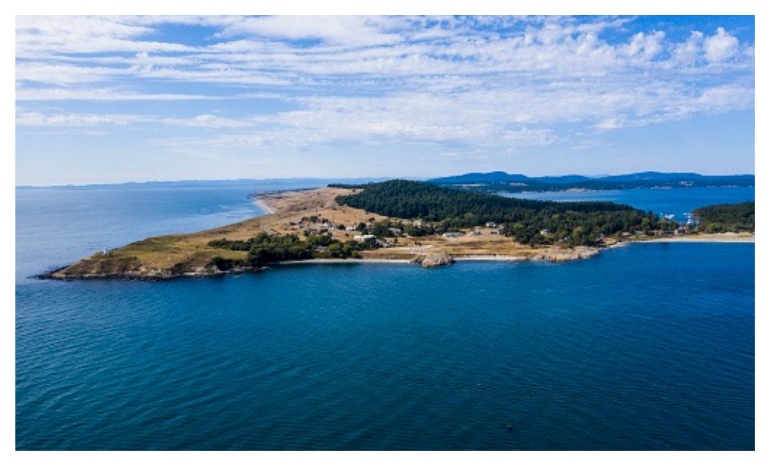
Cattle Point, San Juan Isand

Consistent with the Public Hospital District definition, the service area is defined as all of San Juan Island, as well as Stuart, Henry, John's, Spieden and Pearl islands. The remainder of the county is considered a secondary service area.